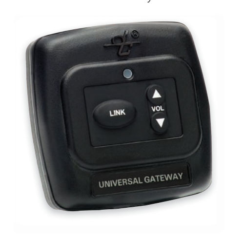
U9921-GUV Universal Gateway

The U9921-GUV Universal Gateway acts as a relay for all audio between wireless users and existing David Clark wired systems and their connected mobile radios. The U9921-GUV is the ideal solution to problems associated with typical wired intercom system limitations of movement.