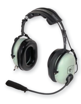
Series 6200 Radio Direct headsets connect directly to your two-way radio without the need for an adapter.

David Clark noise-attenuating headsets with noise-cancelling microphones facilitate clear and effective reception and transmission on portable two-way radios. A variety of headset styles and configurations — with and without adapters — are available for virtually hundreds of two-way radio makes and models.