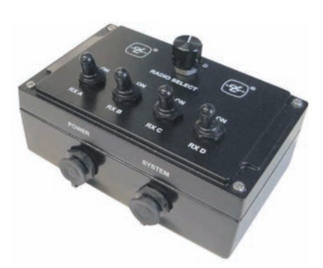
M-RIM Multi-Radio Interface Module

The David Clark Company Multi-Radio Interface Module (M-RIM) is a weather-resistant, marine-grade radio interface designed for outdoor and marine environments. It is engineered to provide transmit and receive capabilities for up to four mobile radios, greatly expanding current system capabilities and/or centralizing radio control for system users.