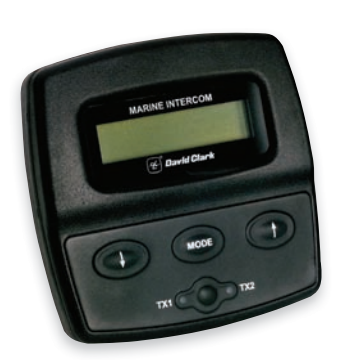
U9810PD Multi-Function LCD Panel Display

The Series 9800 Panel Display is a user-friendly, intuitive interface that is used to customize the intercom and audio system for an enhanced boating experience. Easy-to-read LCD display and tactile push-button controls